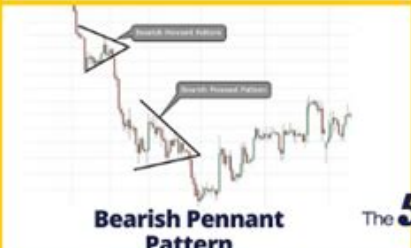
Bearish Pennant Pattern