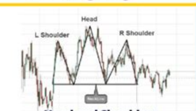
Head and Shoulders