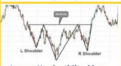
Inverse Head and Shoulders