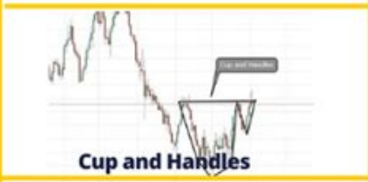
Cup and Handles