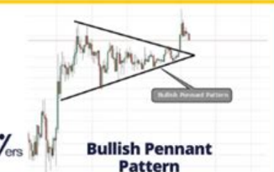
Bullish Pennant Pattern